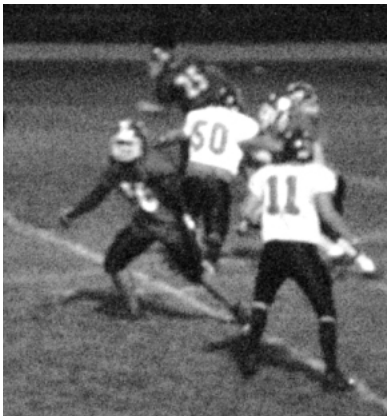
Analy and El Mo football players battle once more for the Apple.

Don't forget to bring in canned goods for the food drive this week! Food for Thought is a great organization dedicated to helping terminal AIDS patients in Sonoma County. We need spaghetti sauce, cranberry sauce, stuffing mix, and breakfast cereal, but anything non-perishable is great!