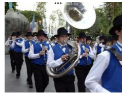
Analy Band performing at Disneyland

Honors & Advanced Placement: English , Sci-