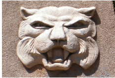
Mascot: Tigers Colors: Royal Blue & White

Analy High School sits on the beautiful Laguna de Santa Rosa midway between the busy 101 and the wild woods and beaches of the Sonoma Coast. Analy is