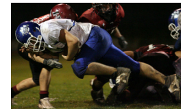
Competitive athletics with rich history of champions

Analy High School Tigers are a member of the Sonoma County Athletic League. Our Athletic Department consists of 41 teams in 12 different sports. It is committed to providing a superior athletic program to enhance the development of positive student habits and attitudes. Life long lessons in